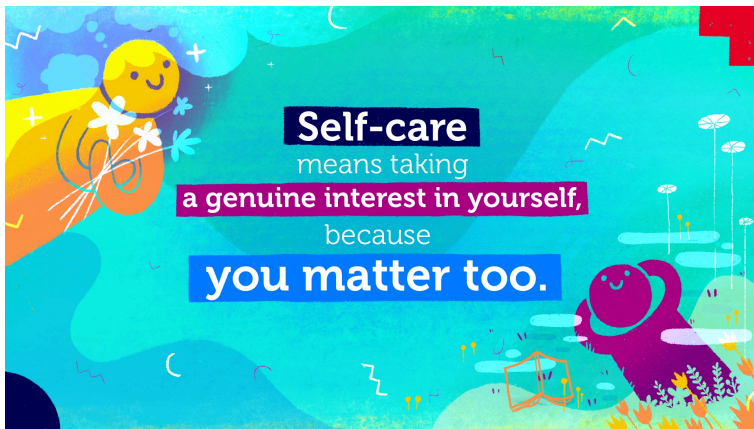
“Self care wallpaper” by RMIT Studios is licensed under CC BY-NC 4.0

*Here, insert resources for students – e.g. wellbeing reminder wallpapers “one of these wallpapers to use on your device as a handy reminder to take time out for you”. Examples have been provided below.*